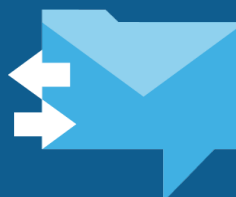
FILE BACKUP & COLLABORATION