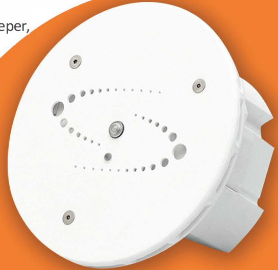
*HALO IOT Smart Sensor - Patent Pending*

There is no more excuse for the thousands of security incidents that occur each year in privacy areas, get the protection of HALO!